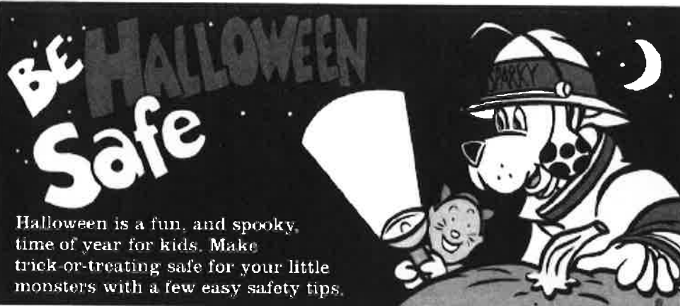
Sparky® is a trademark of the NFPA.